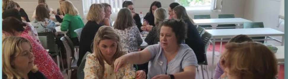
Attendees at Masterclass, learning how early experiences influence brain development, with the Brain Architecture Game.

Following delivery of the IMH masterclass, twenty attendees committed to the formation of an IMH network. The masterclass gave attendees the baseline shared IMH language to further develop their learning and support bringing an IMH lens to their practice.