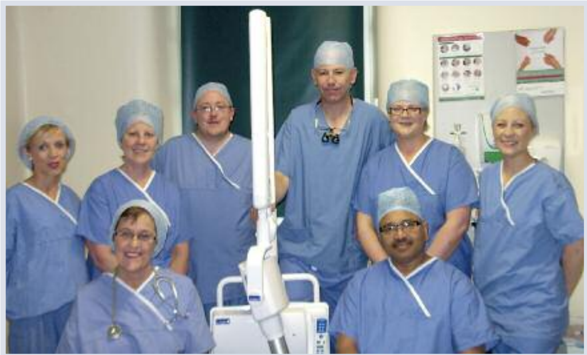
Dental Surgery Team at Roscommon Hospital

As part of the HR agenda to improve the availability of information to staff, it is proposed to develop an Employee Relations Information portal on Sharepoint in which essential policies, circulars and procedures are stored for easy access by all staff. Work is on-going on this project and information on how to access these documents will be disseminated to staff in due course.