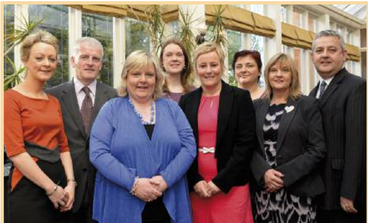
Nursing Leadership Programme Launch 6339