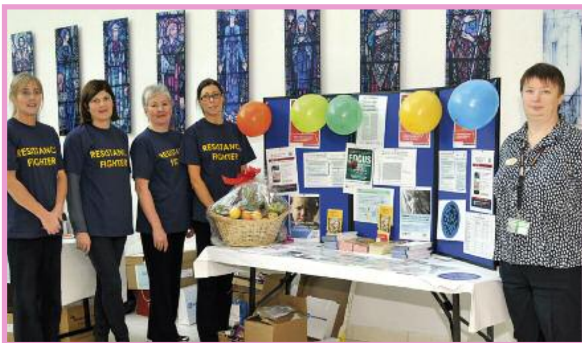
Antibiotic Awareness at Mayo General Hospital

Key Action 14: Work with Shared Services and National IT and implement HR Systems