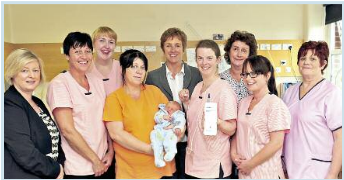
Portiuncula Newborn Hearing Screening

The Strategy identifies a number of key action points at the end of each section which together form an overall implementation plan. This plan will be endorsed and regularly reported to the Executive Council, Clinical Directorates and our Joint Union Management Forum.