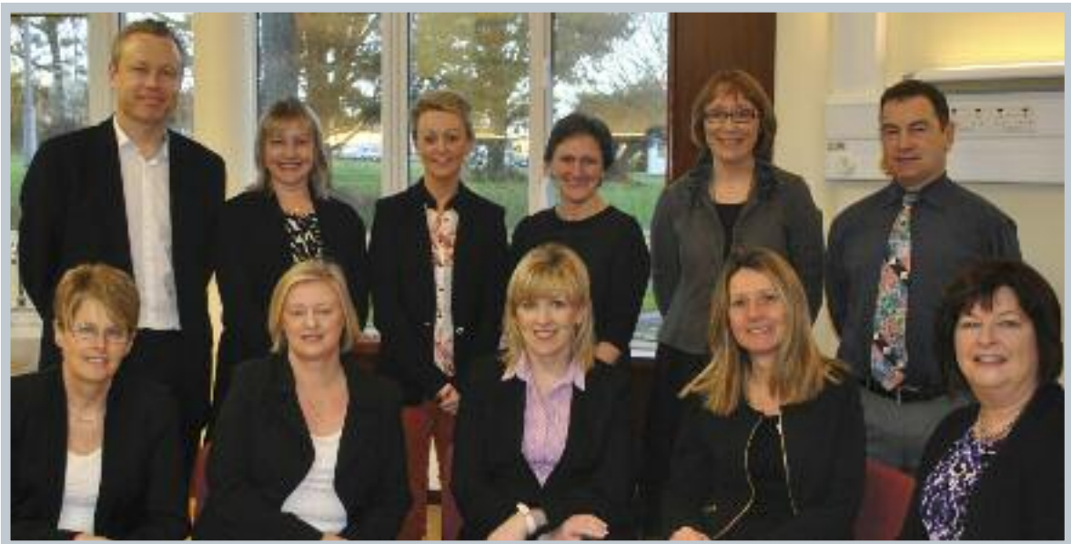
Future Leaders participants