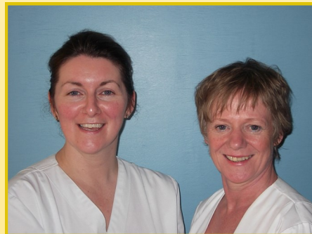
Nursing Staff from the Minor Injuries Unit

After 8:00 pm, please go to your nearest Emergency Department or contact your local GP.