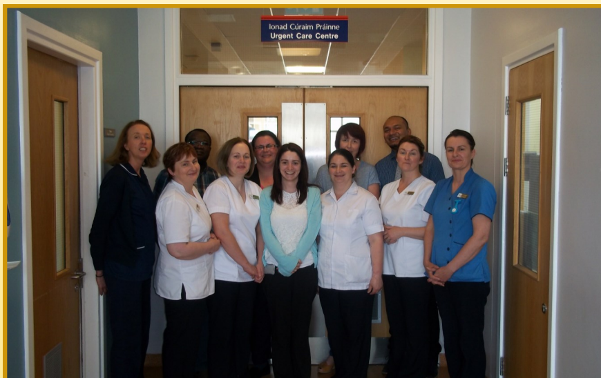
Staff at the Minor Injuries Unit

Please go to your nearest Emergency Department or call an Ambulance on 999 or 112